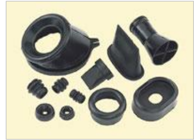
Suspension and buffers