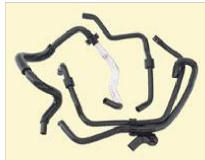
Turbo charger hoses, vacuum hoses, vent & power steering hoses