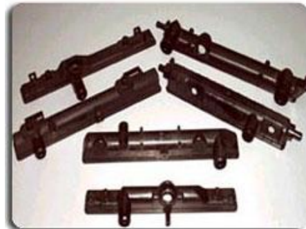
Radiator end tanks