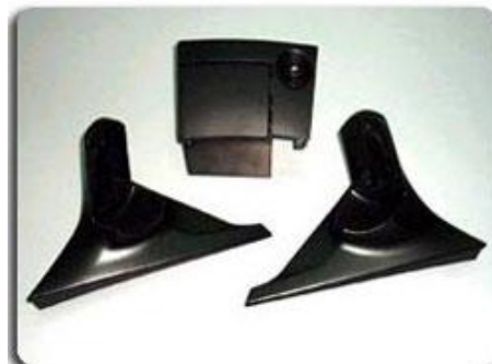
Auto decorative parts