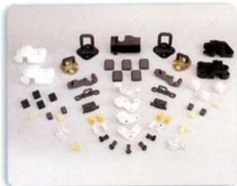
Door striker parts