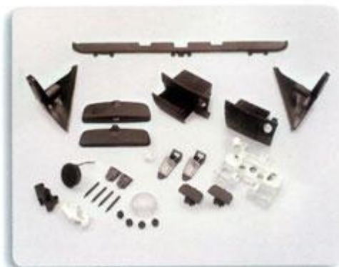
Car interior / dashboard parts