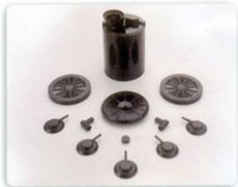
Body canister parts