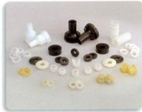
Chassis and steering system