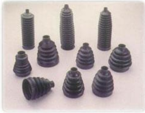
CVJ and rack & pinion boots