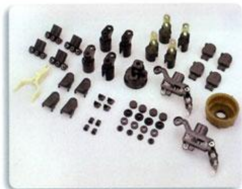
Starter / alternator parts